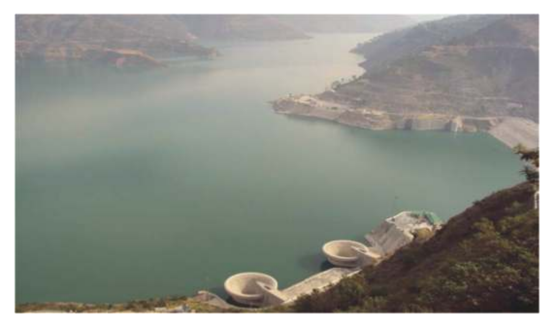
A view of Right Bank Shaft Spillway of Tehri Dam Site