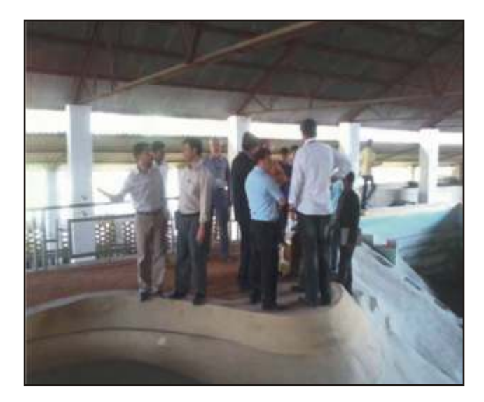
Visitors at Field Research Station, Bahadrabad (Hardwar)