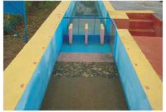
proposed clear water way of 972 m with

Model studies were conducted for Mironi barrage, proposed to be constructed across Mahanadi River in Chattisgarh, on geometrically similar 2D-model built in a flume to the scale 1:35. Observations from the hydraulic tests indicated that the