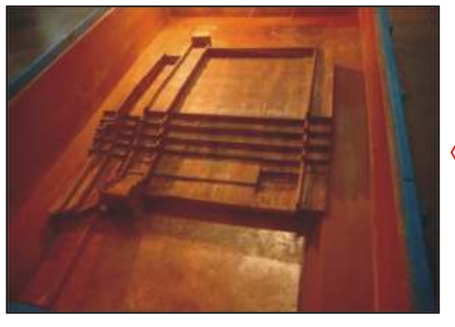
EHDA model of Jorthang Barrage (Sikkim) showing experimental set-up In Ground Water Laboratory