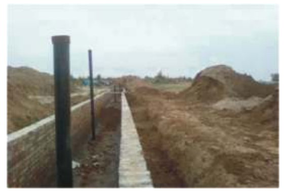
artificial recharge exists but its feasibility has to be studied as per guidelines provided in CGWB Manual on Artificial Recharge of Ground Water.

The report deals with feasibility study and preparation of DPR for artificial ground water recharge in Distt. Mahendragarh of Haryana State. The Sponsor (PHEC,Rewari) informed that needs of water in the district for agriculture, drinking and industrial purposes are fulfilled by ground water because of that the ground water has become over burdened and overexploited. This phenomenon exists only when extraction of ground water is more than the natural recharge. Therefore need for