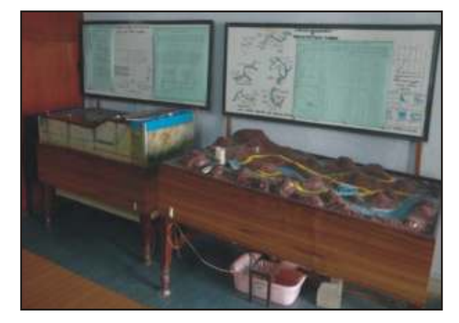
Measurement of Discharge using Tracer Technique