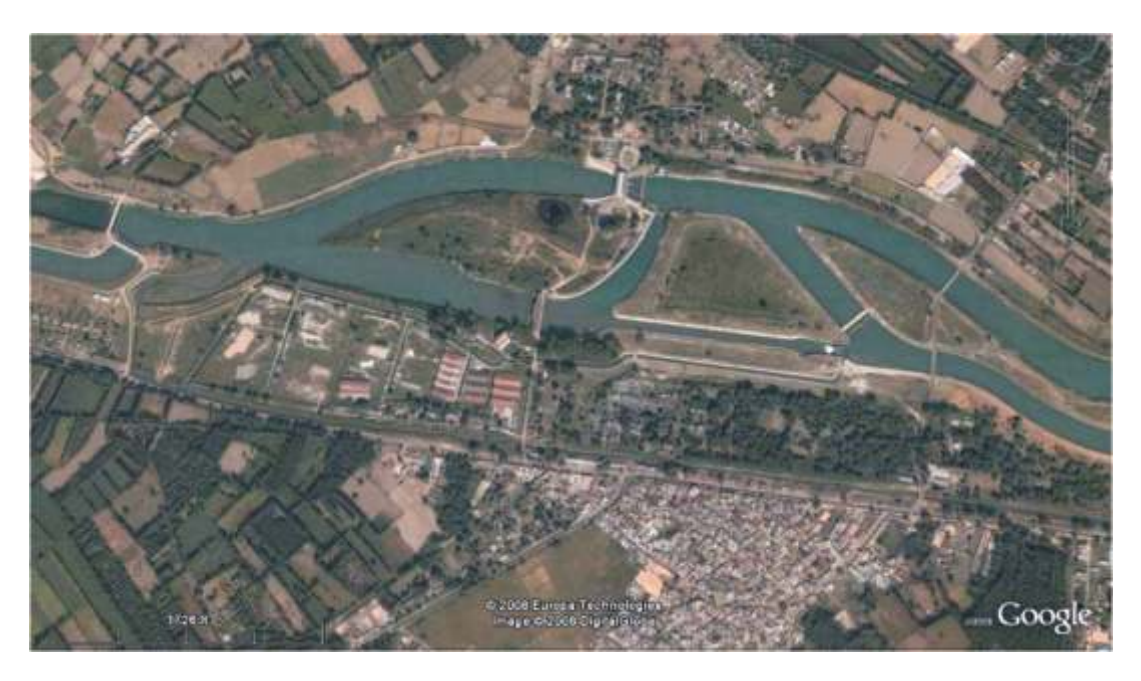
A Panoramic View of BAHADRABAD from Google Earth