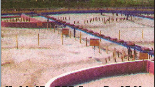
Model of Bogibil Rail cum Road Bridge (Assam)

Model of Diversion Tunnel of Dibbon H.E.P.(Arunachal Pradesh