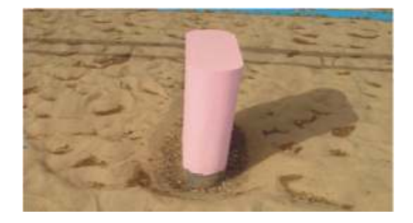
View of scour around pier at 90^{\circ} flow for f = 9.297