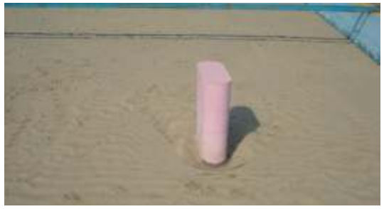
View of scour around pier at 90^{\circ} flow for f = 8.222